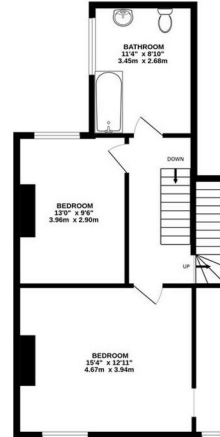
1ST FLOOR 592 sq.ft. (54.7 sq.m.) approx.