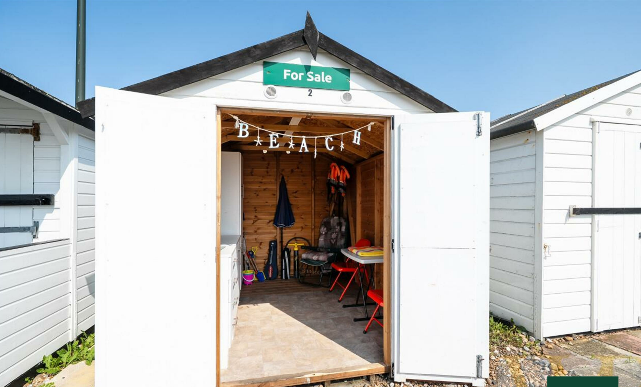
Beach Hut 2, Brooklands Brighton Road | | Lancing | BN15