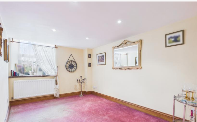
Dining Room/ Bedroom Three