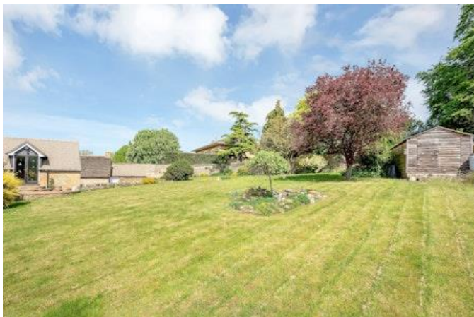
Outbuilding 2.71m x 3.84m (8'11" x 12'7")