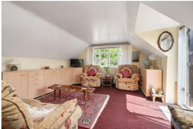
Lounge 3.71m x 4.7m (12'2" x 15'5")