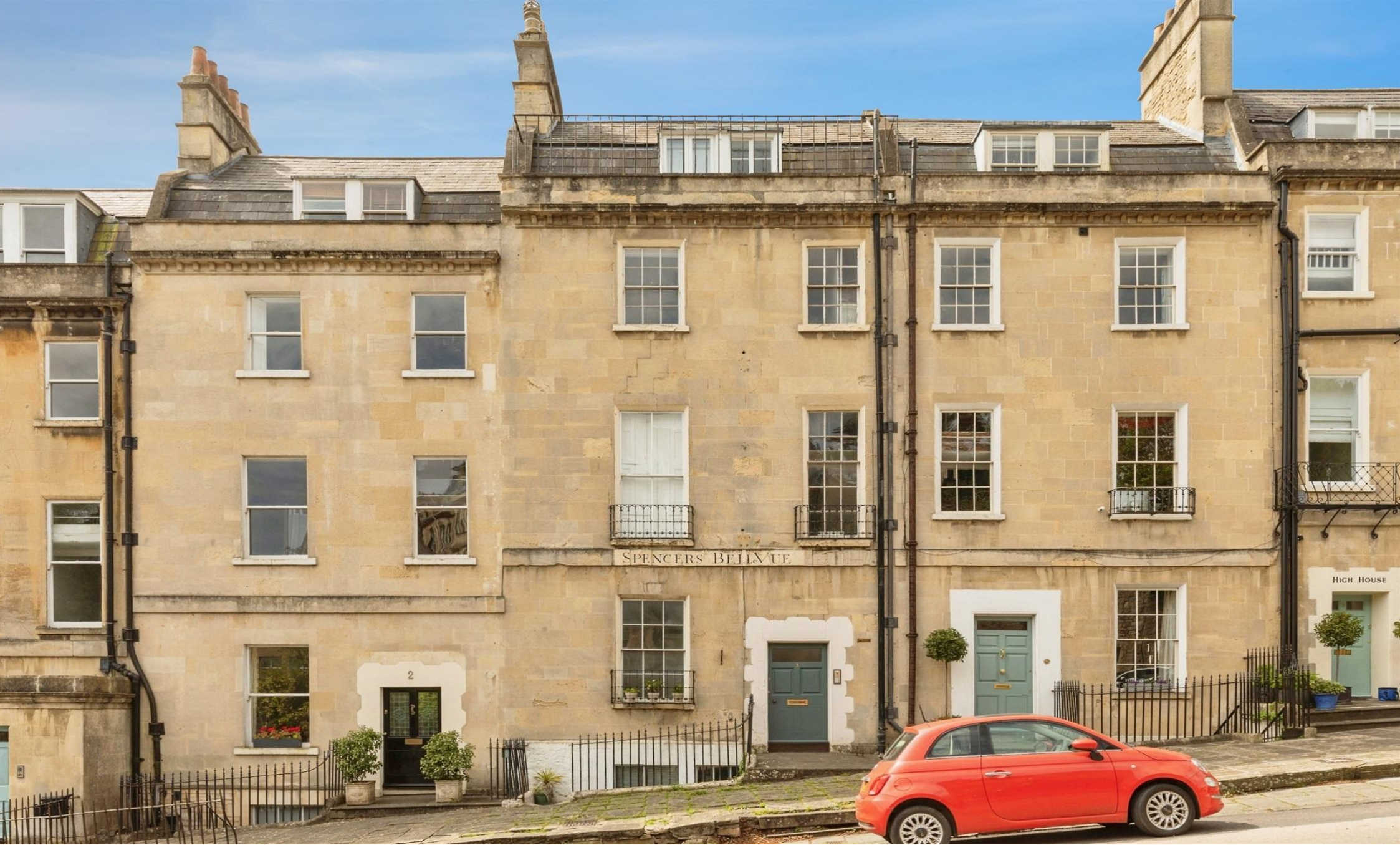
The Ground Floor Flat Spencers Belle Vue, Bath BA1 5ER