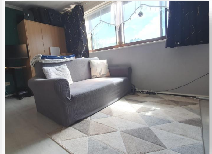
Ivel Court, YEOVIL, BA21 4HX