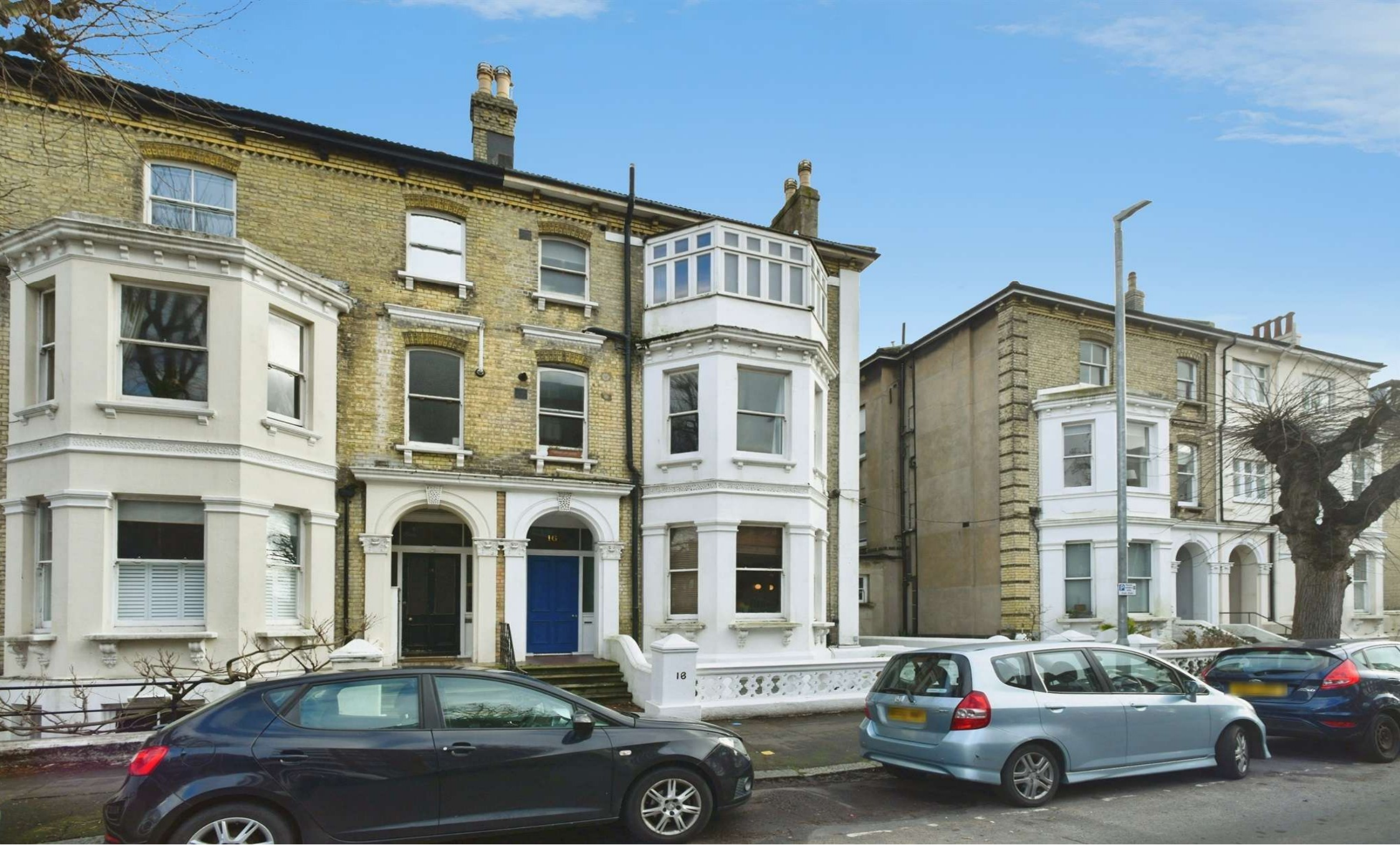
Wilbury Road, Hove BN3 3JN