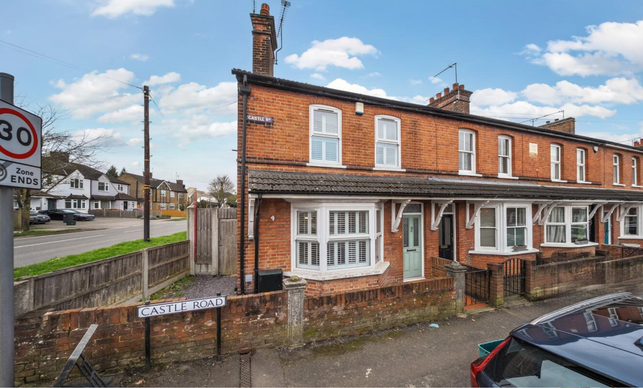
Castle Road, St. Albans AL1 5DG