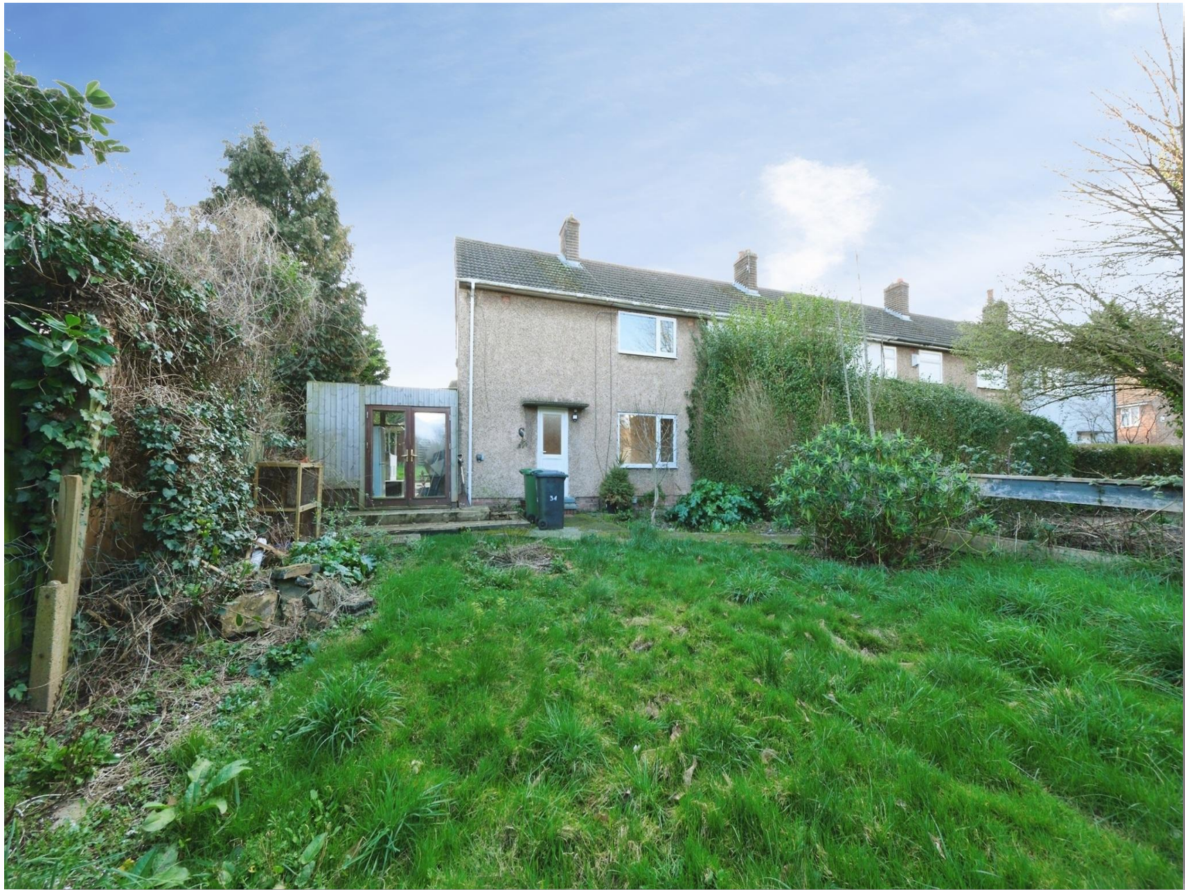
Lymn Avenue, Gedling Nottingham NG4 4EA