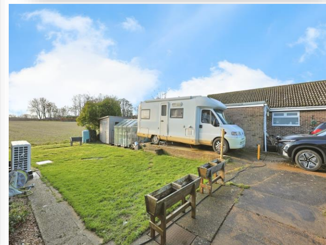
Bull Close, East Tuddenham Dereham NR20 3LX