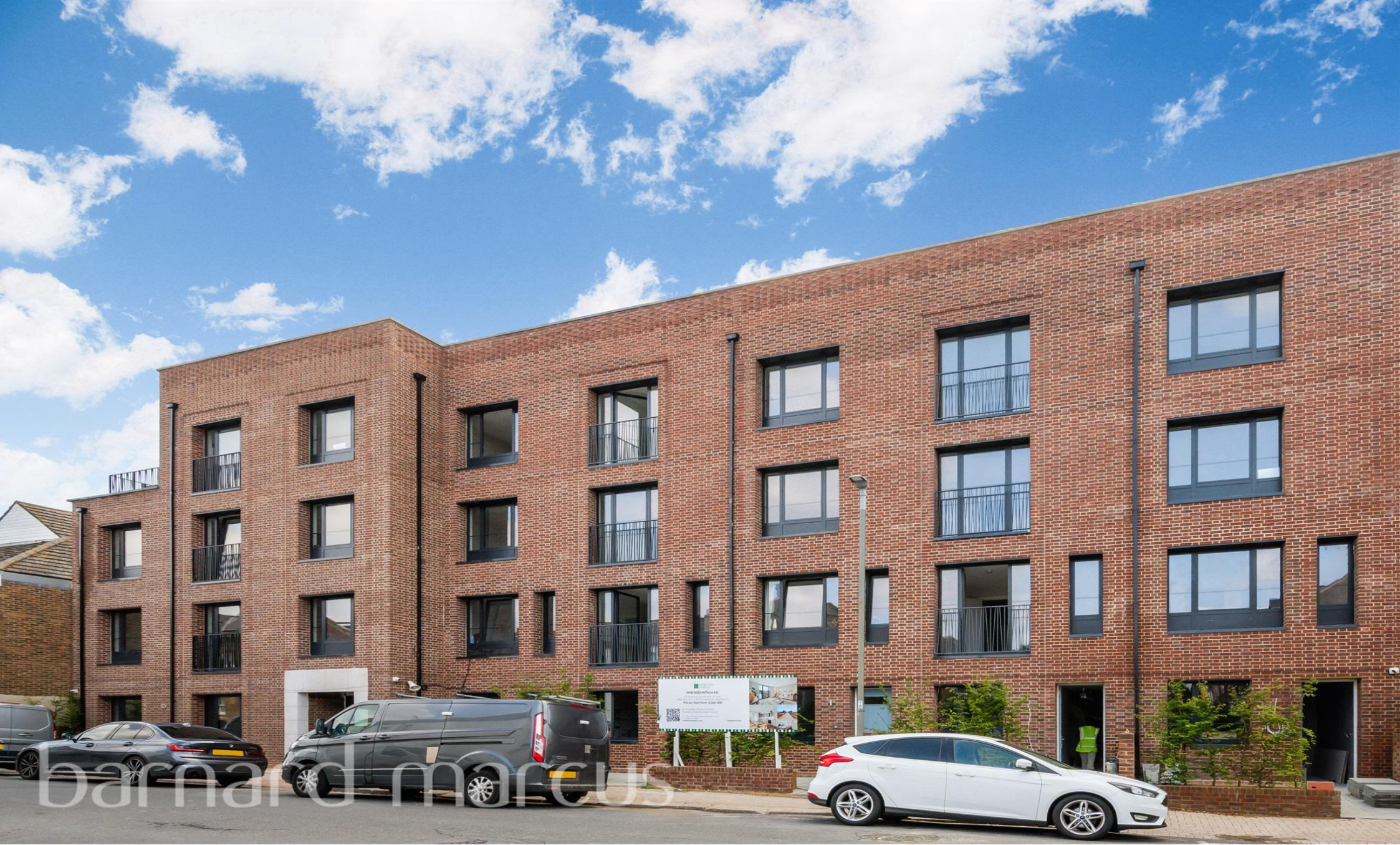
Meadow House Fallsbrook Road, London SW16 6DY