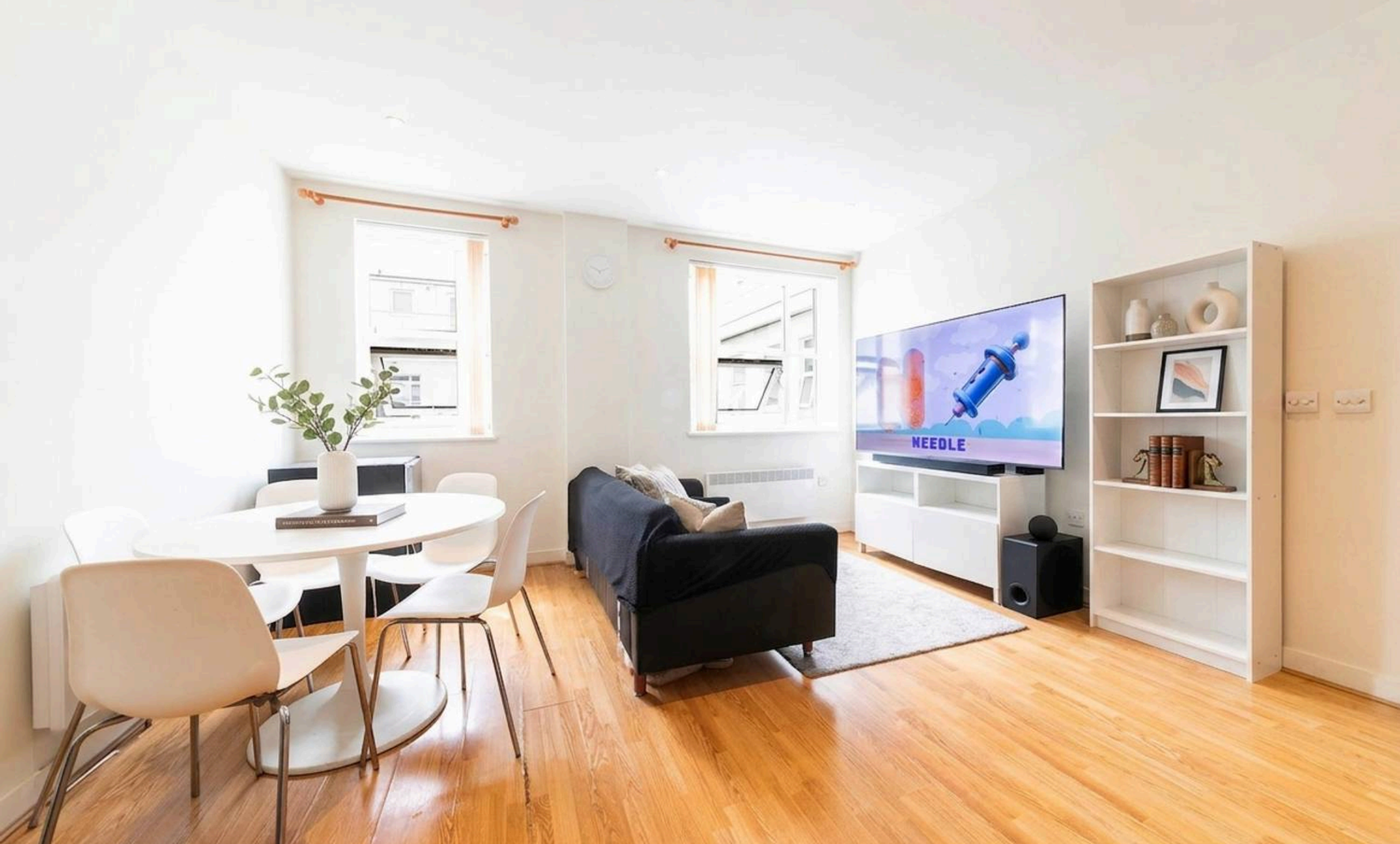
Bromyard House, London, W3 £2,150 pcm