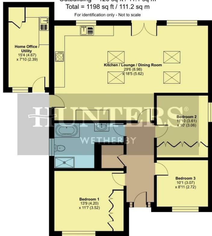
GROUND FLOOR APPROX FLOOR AREA 100.1 SQ M (1078 SQ FT)

Floor plan produced in accordance with RICS Property Measurement Standards incorporating International Property Measurement Standards (IPMS2 Residential). © nlcocom 2026. Produced for Hunters Property Group. REF: 1439815