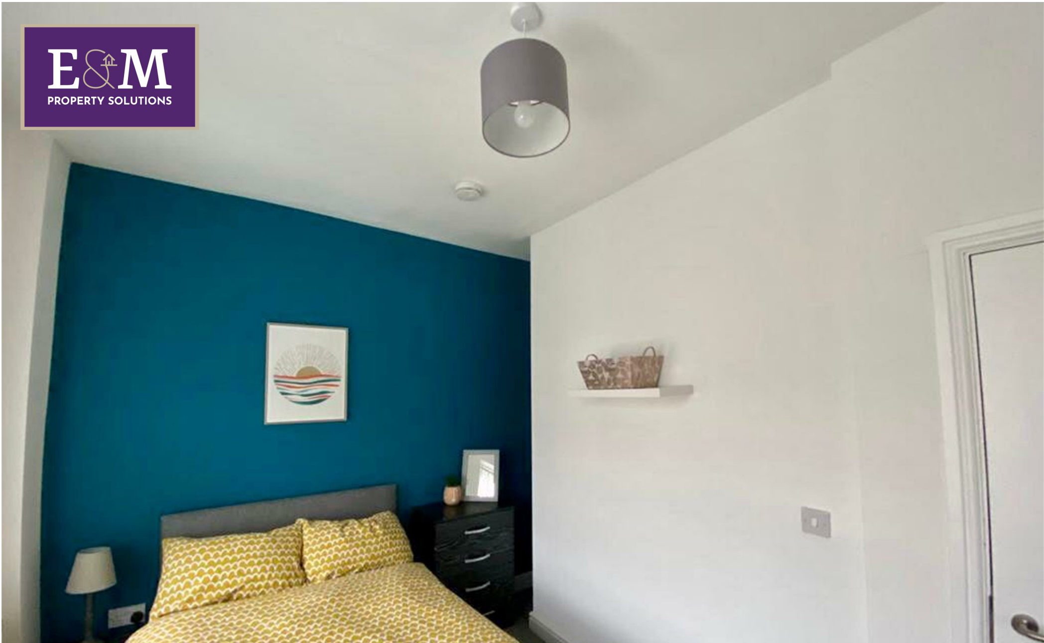
ROOM 4, 10 Harold Street, Burnley, Lancashire, BB11 4NU £90 Per week