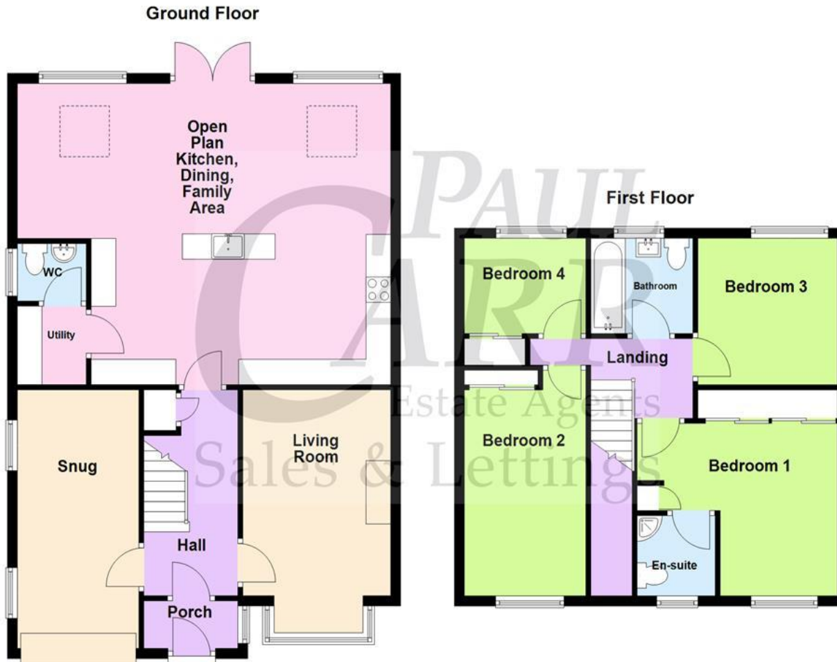
This floorplan is not drawn to scale and is for illustration purposes only Plan produced using PlanUp.

This floor plan is not drawn to scale and is for illustration purposes only