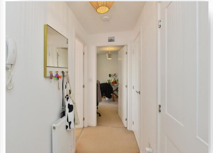
Flat 4 Apollo Avenue, Fairfields Milton Keynes MK11 4AR