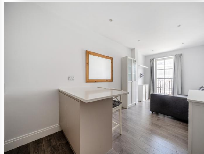
Apartment 7 Cresset Court, 73 High Street, Maidenhead SL6 1JX