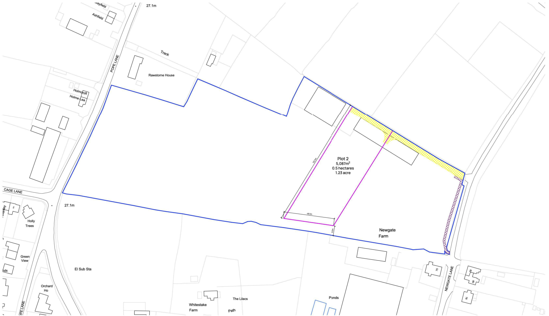
Land Registry Plan - Plot 2 Scale 1:1250