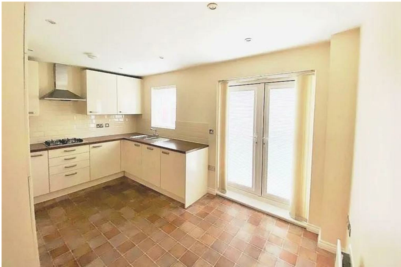
KITCHEN / BREAKFAST ROOM (pic 2)

Double Glazed Window & French Doors to the rear garden, fitted with White Gloss wall & base units with dark oak coloured worktops, 1.5 bowl single drainer sink unit with mixer taps, subway tiled splashback and terracotta tiled floor, plus integrated Dishwasher, Double Oven, Gas Hob and Extractor above, plumbed for Washing Machine,