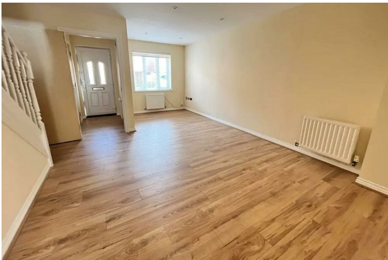
LOUNGE / DINER (pic 2)

Double Glazed window to front, Oak effect laminate flooring, 2 radiators and door leading to;