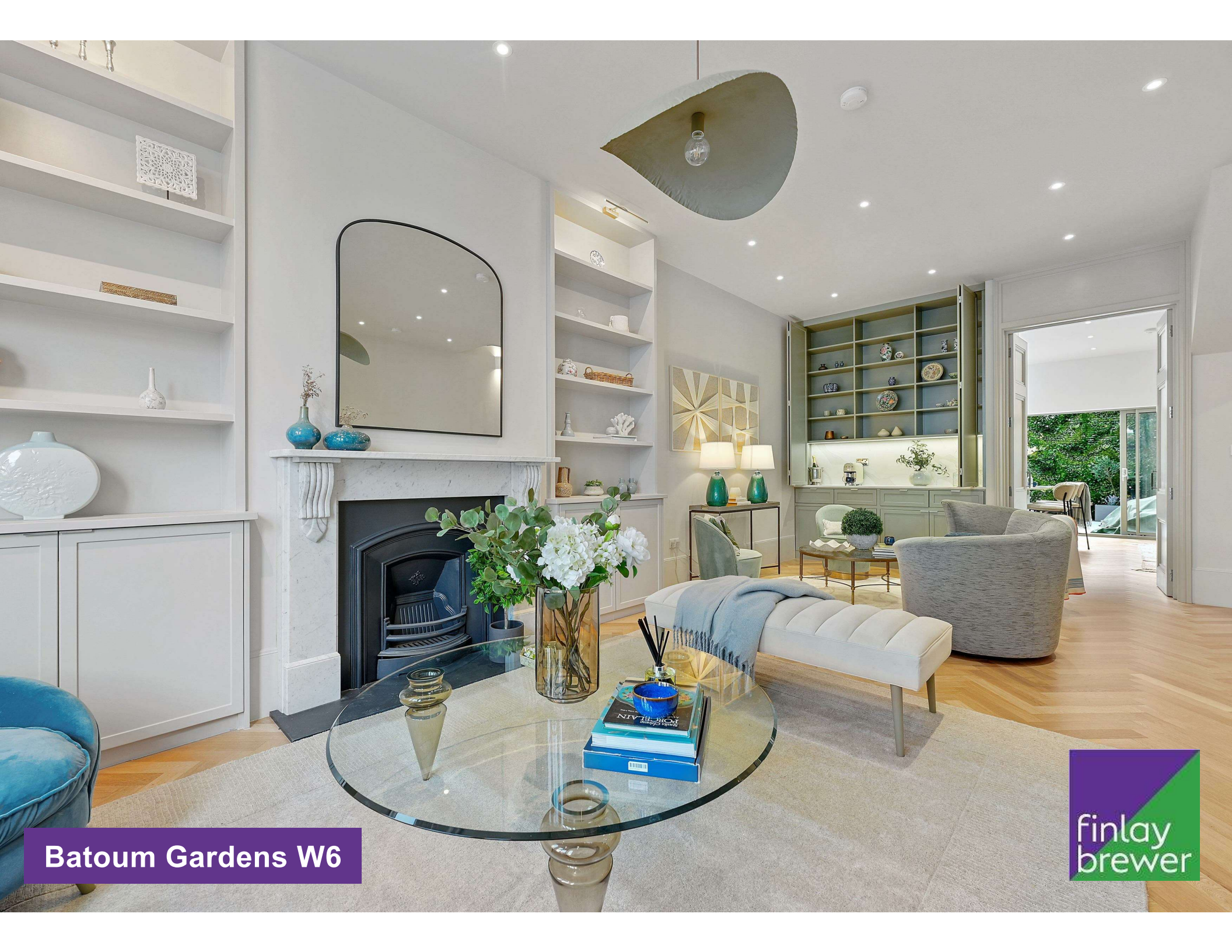
Batoum Gardens W6