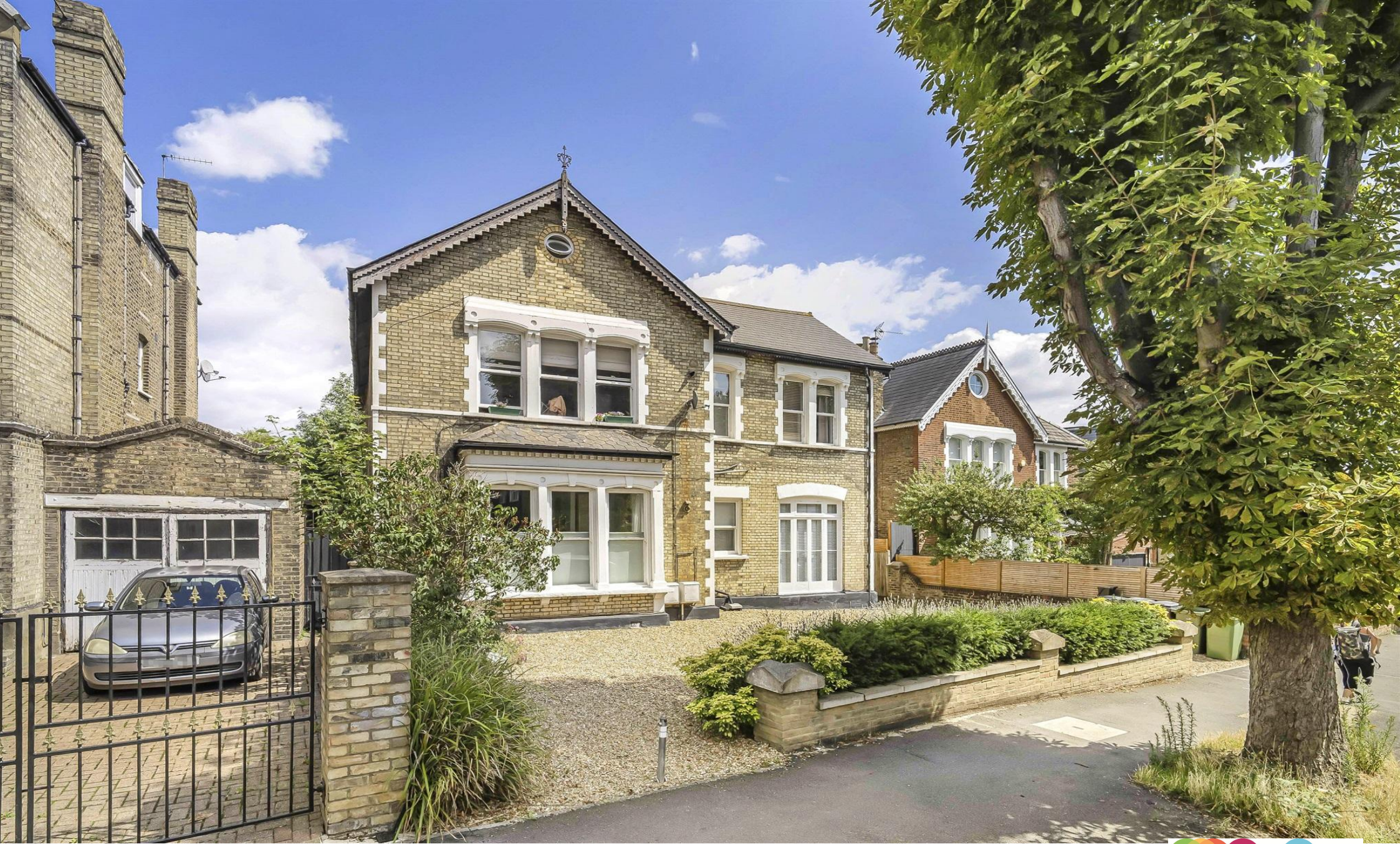
Palace Road, London SW2 3LB