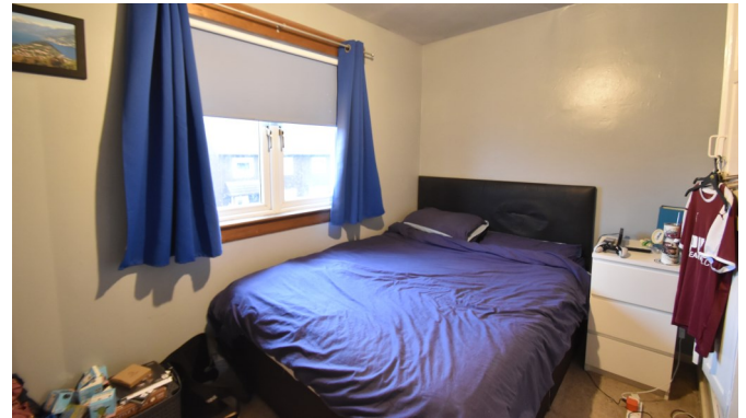
11 Birkhill Crescent