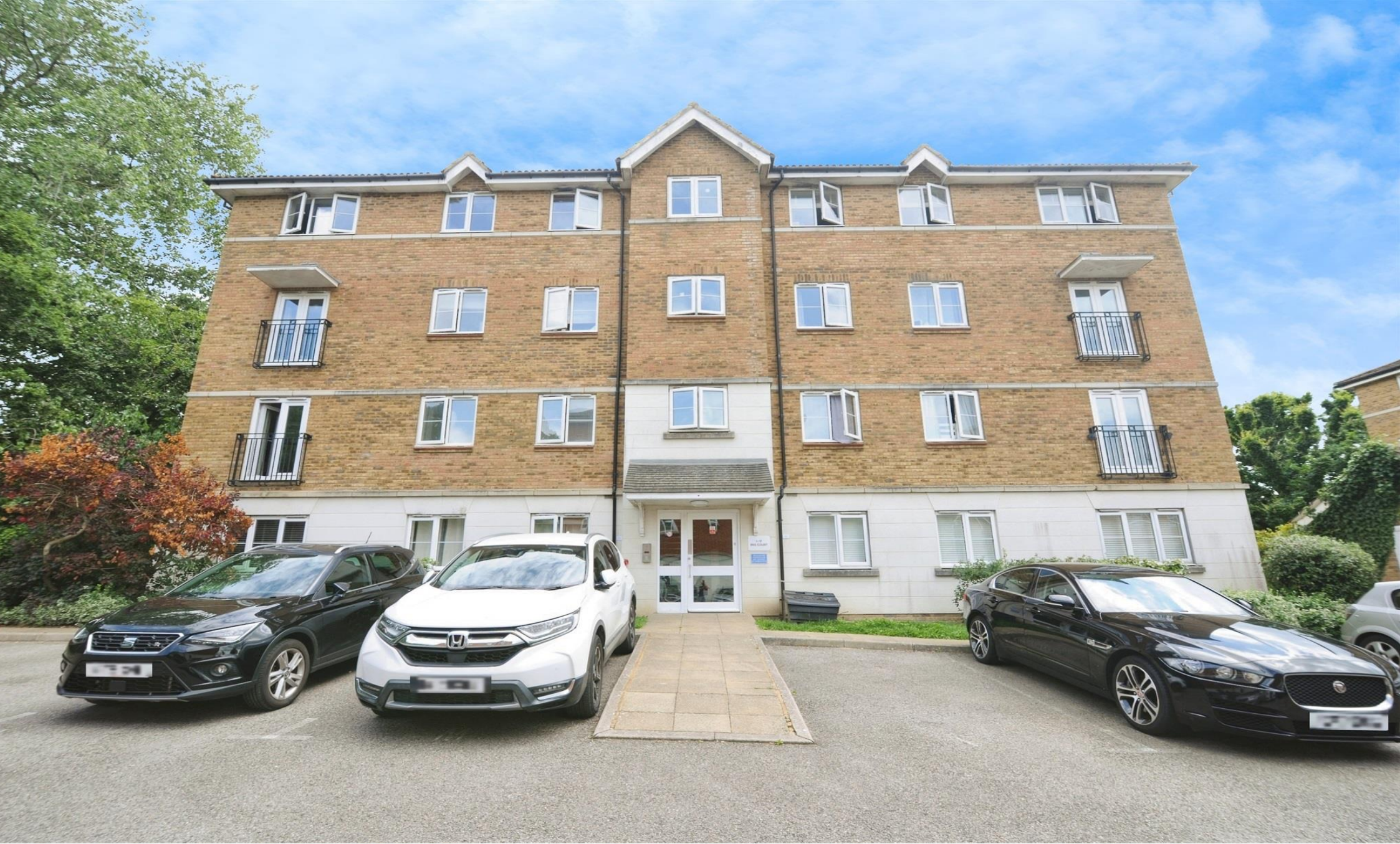
Iris Court Snowdrop Rise, St. Leonards-On-Sea TN38 0GN