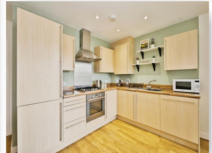
Queensway Court, Queensway Place, Yeovil, BA20 1DU