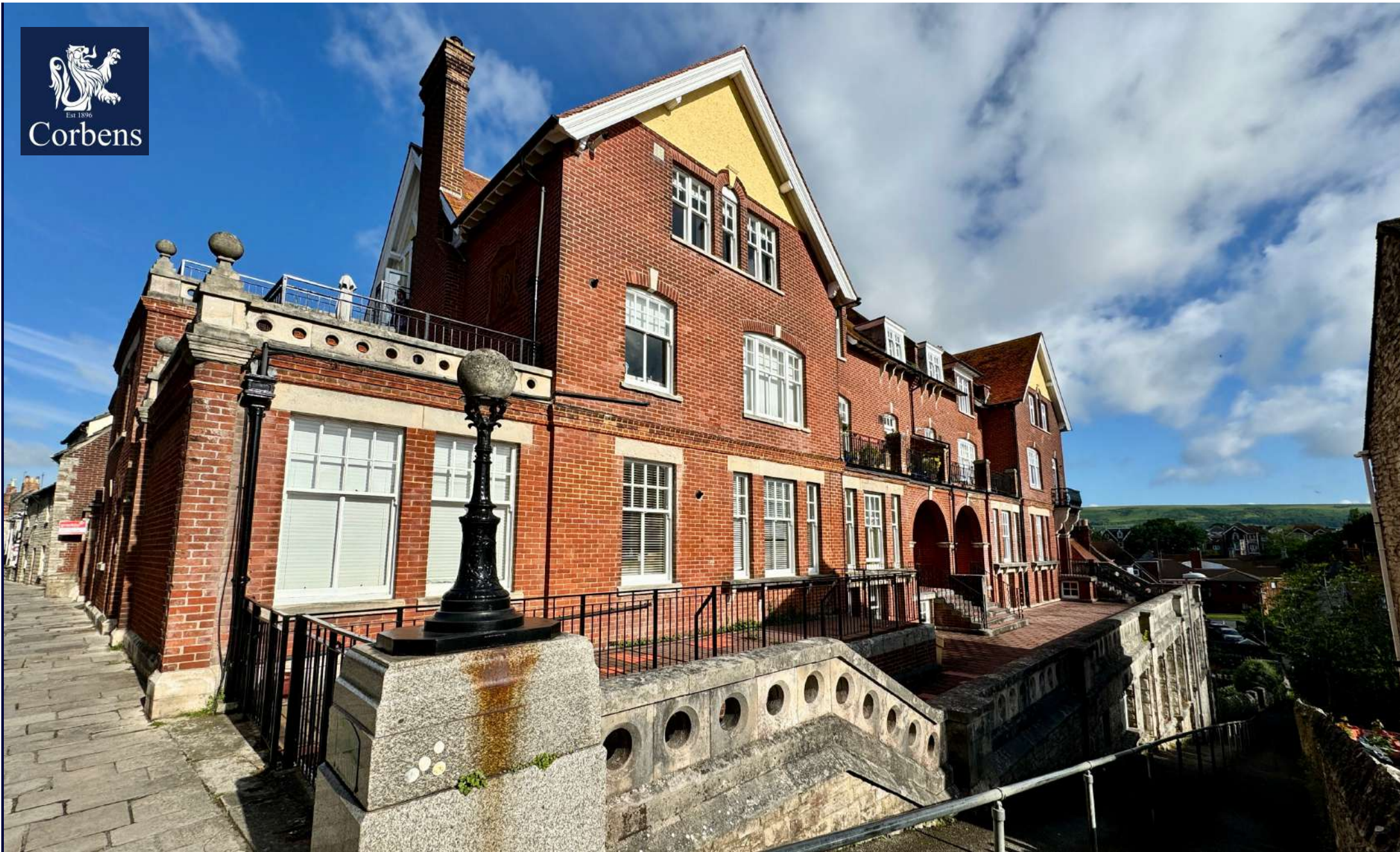
17 SPRINGHILL HOUSE, HIGH STREET, SWANAGE £185,000 Shared Freehold