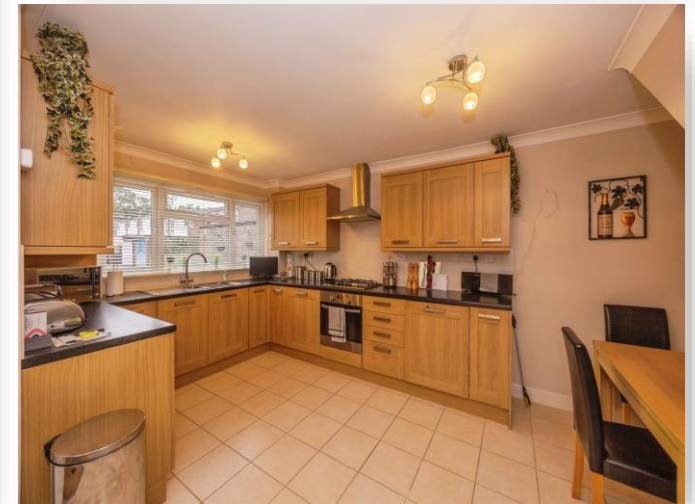
Linnet Close, Waterlooville PO8 9UY