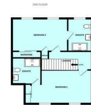
Made with Metropix ©2026