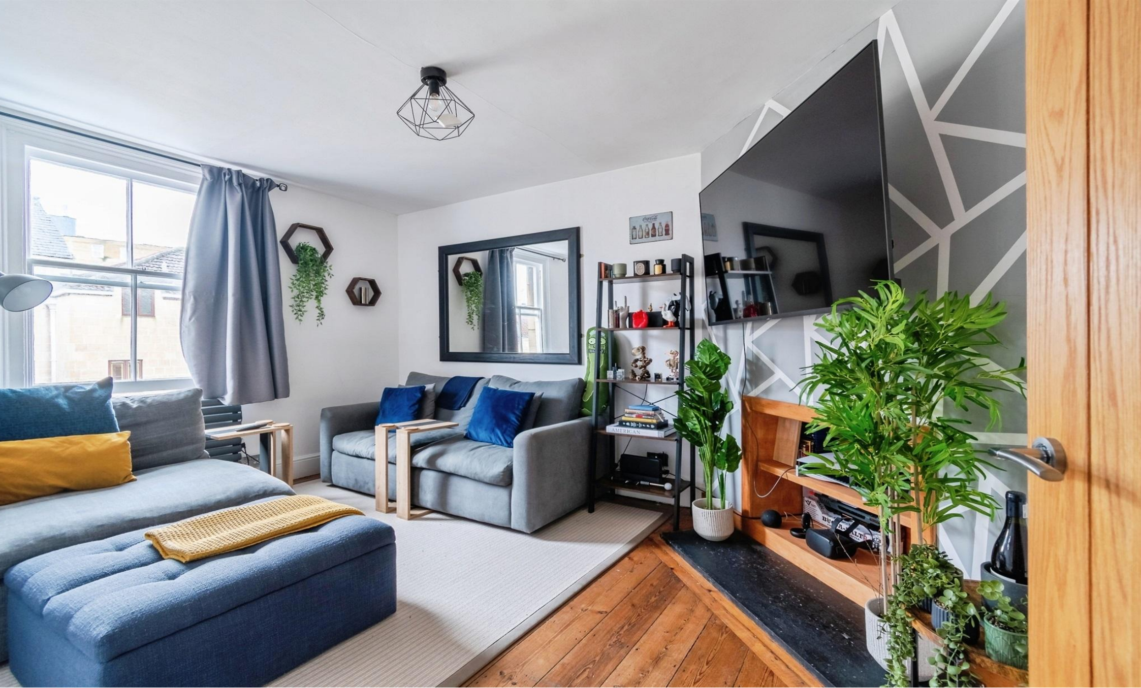
Second Floor Flat 6 Grove Street, Bath BA2 6PJ