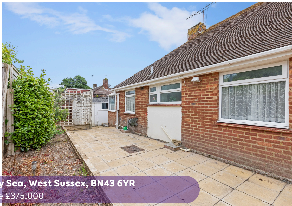
Ashcroft Close, Shoreham by Sea, West Sussex, BN43 6YR Guide Price £375,000