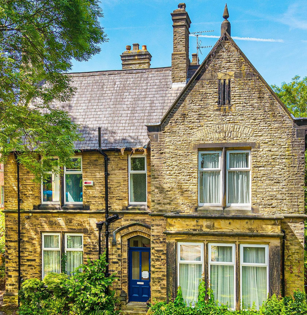
St Johns Vicarage, Forbes Road, Sheffield, S6 2NW