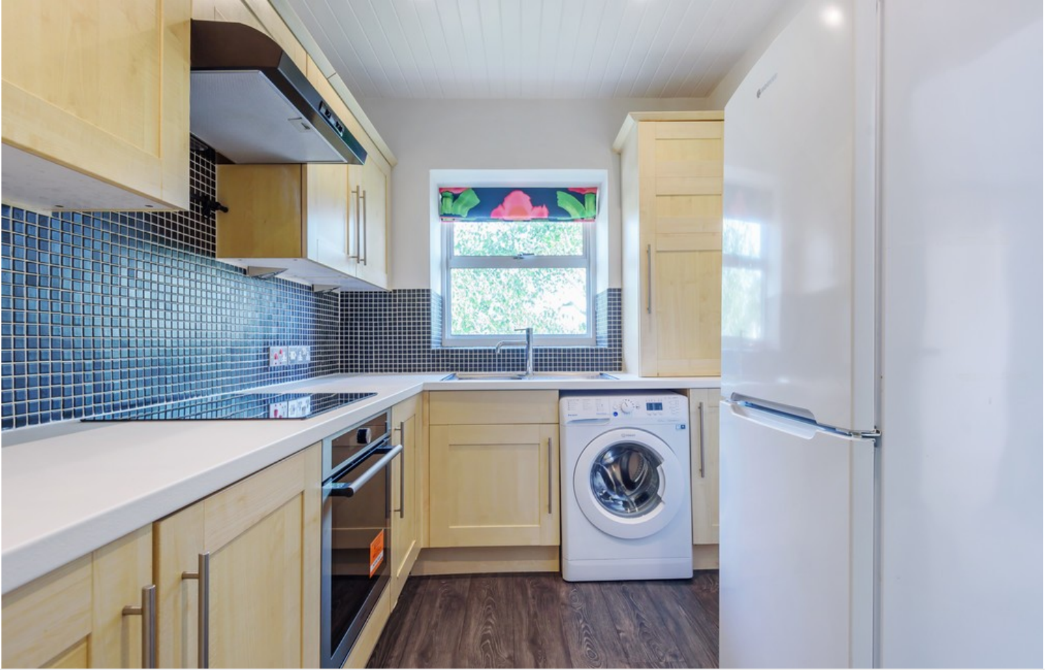
Kitchen with Appliances