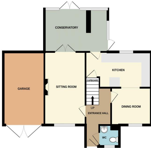
GROUND FLOOR 734 sq.ft. (68.2 sq.m.) approx.