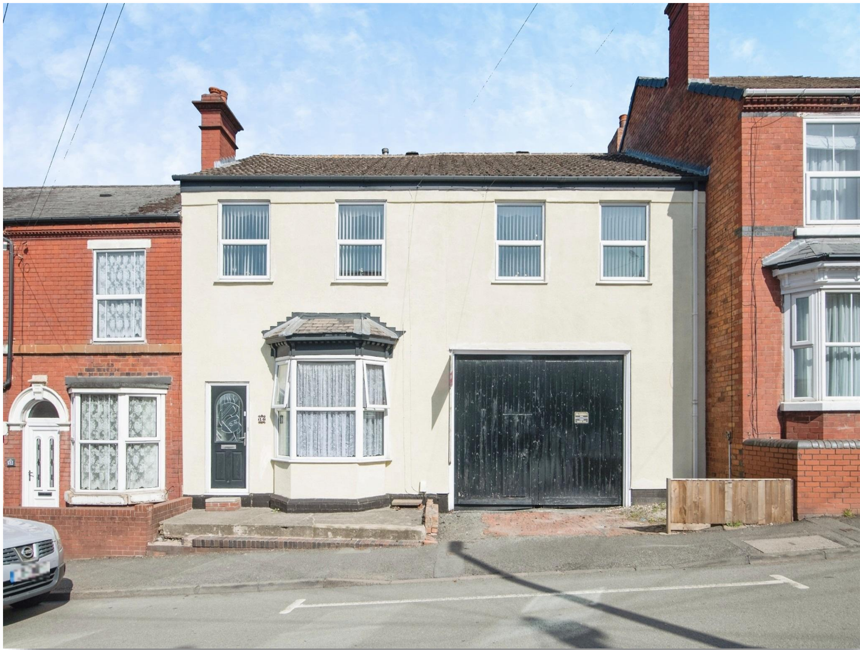
Zoar Street, Gornal Wood Dudley DY3 2PA