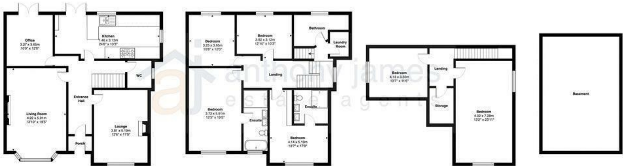
Stanley Avenue, Birkdale, PR8 4RU Total Area: 312.0 m 2 ... 3365 sq ft All measurements are approximate and for display purposes only