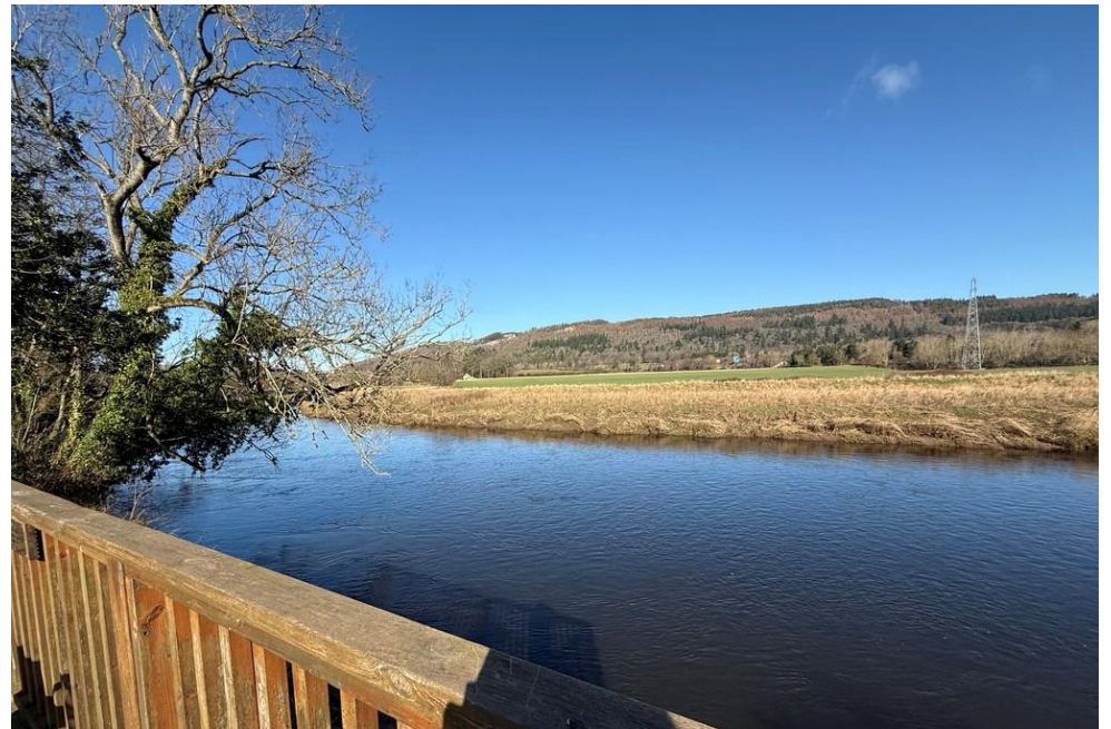
Next Home - 25 Earnbank, Bridge Of Earn, Perth, PH2 9XA