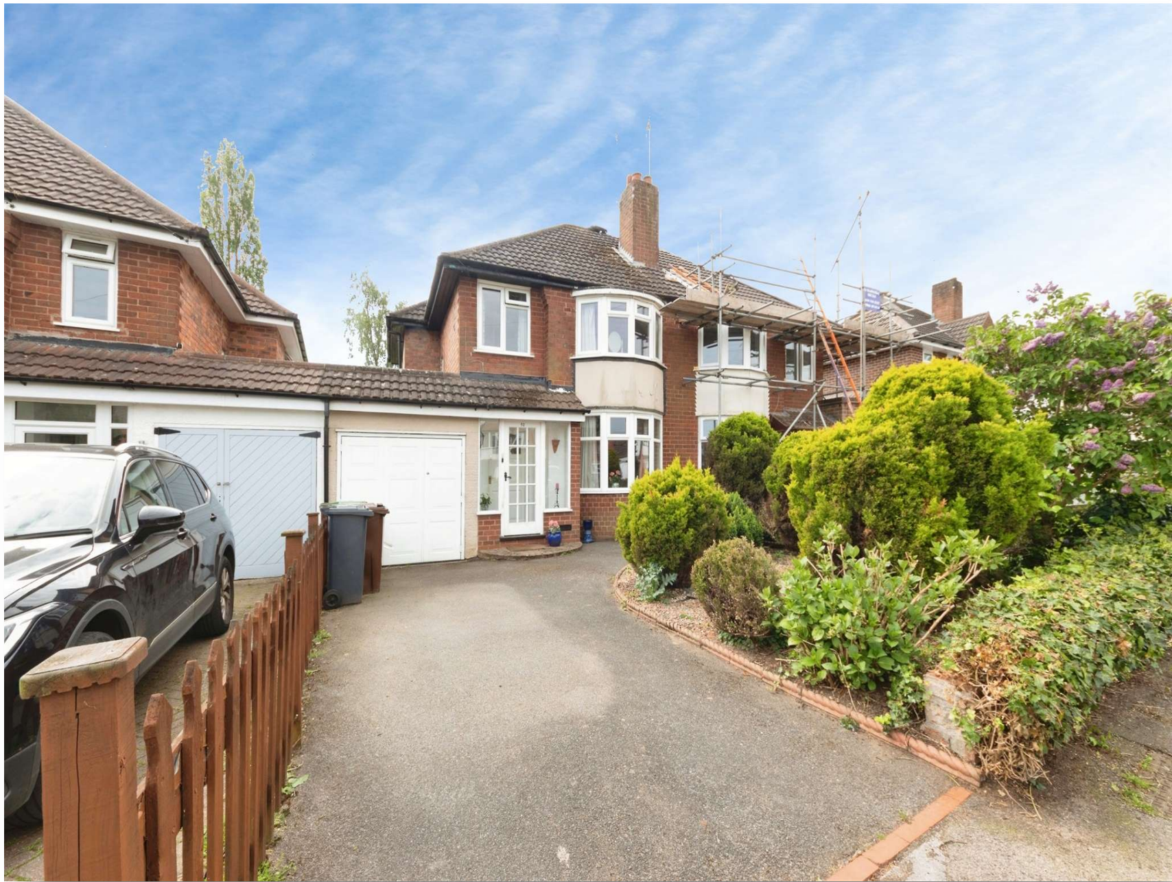
Arnold Road, Shirley Solihull B90 3JP