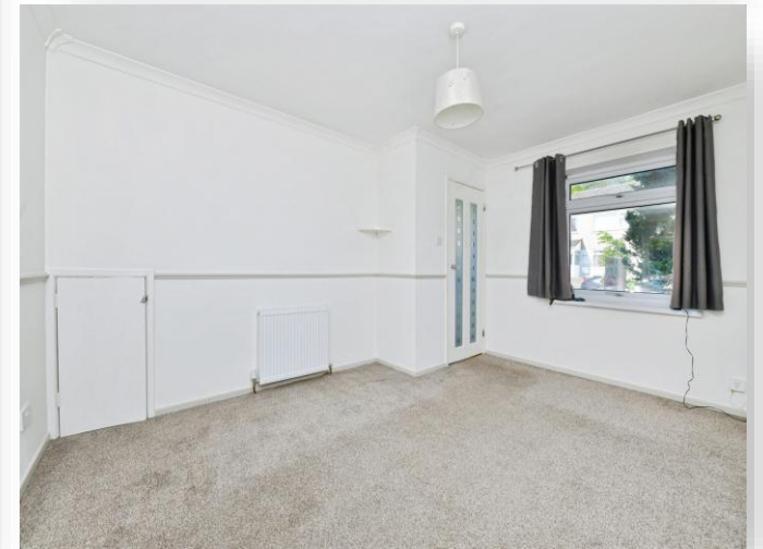
Braemar Close, Plympton PL7 2FA