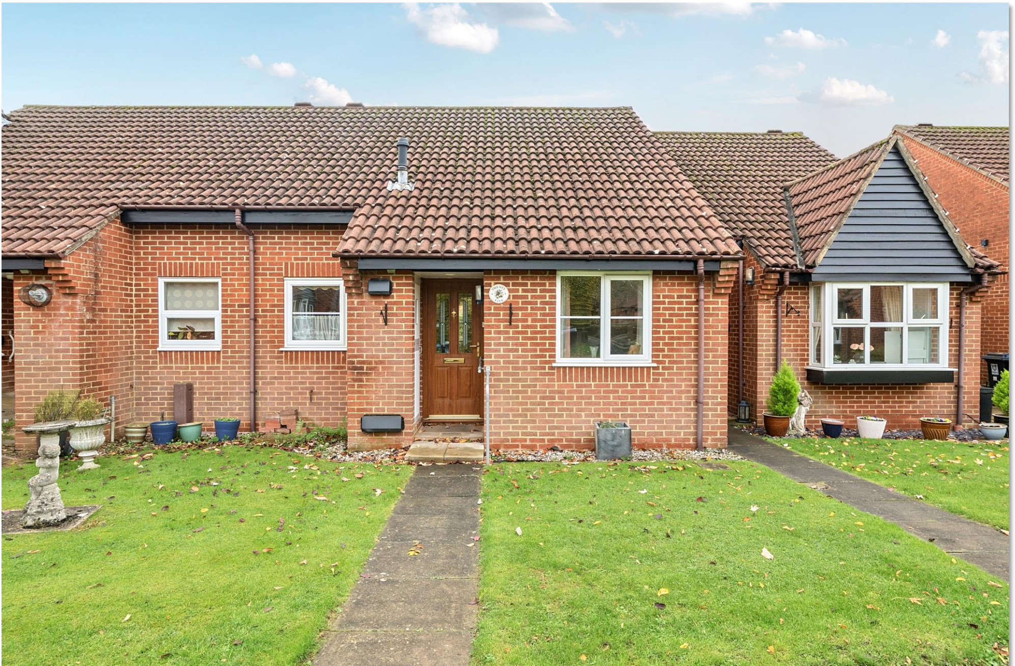
Emerton Garth, Northchurch Berkhamsted HP4 3XJ