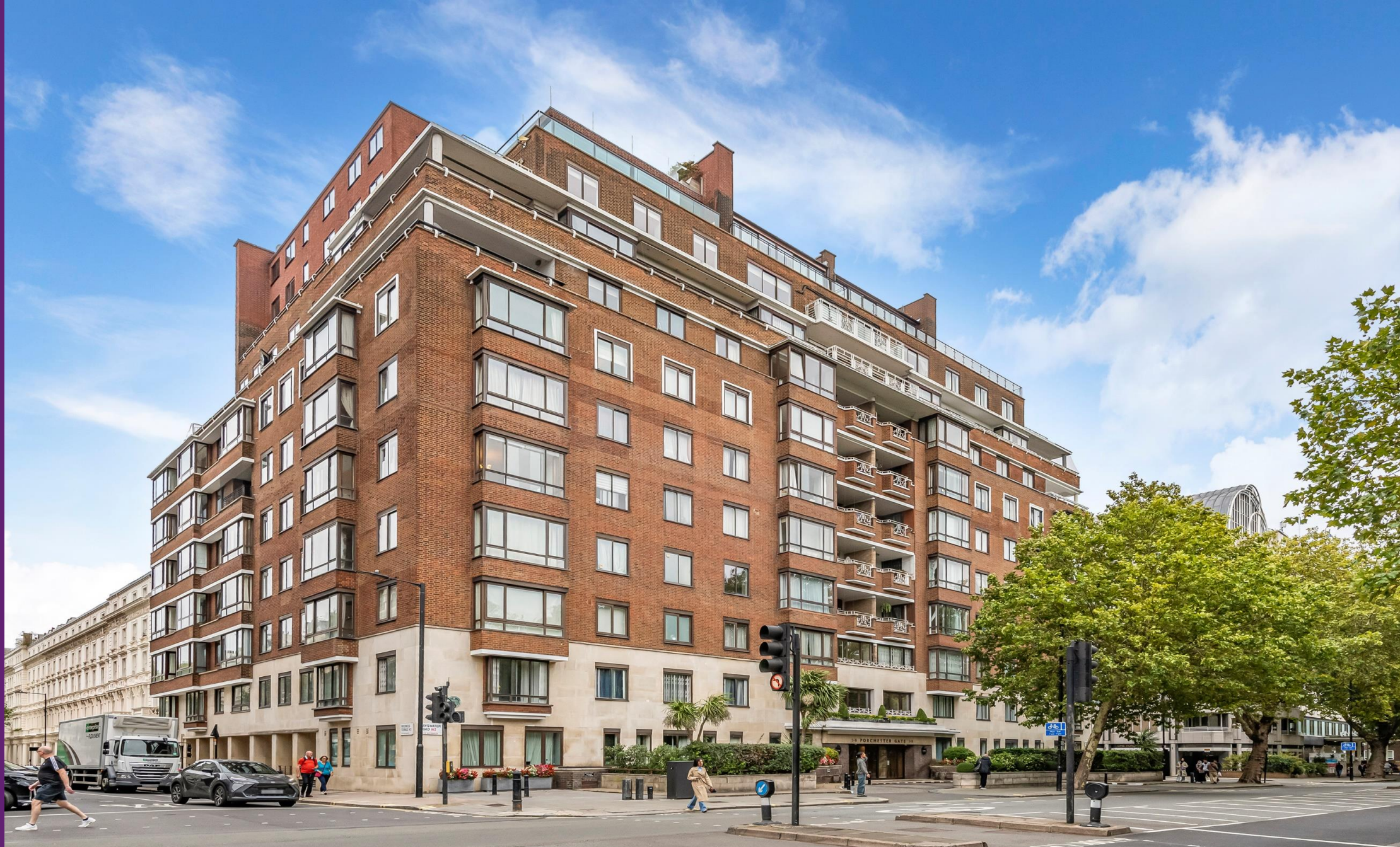
Porchester Gate Bayswater Road, W2