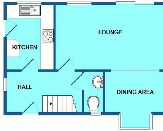
GROUND FLOOR APPROX. FLOOR AREA 415 SQ.FT. (38.6 SQ.M.)