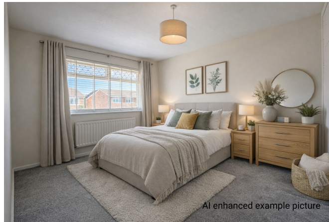
AI enhanced example picture