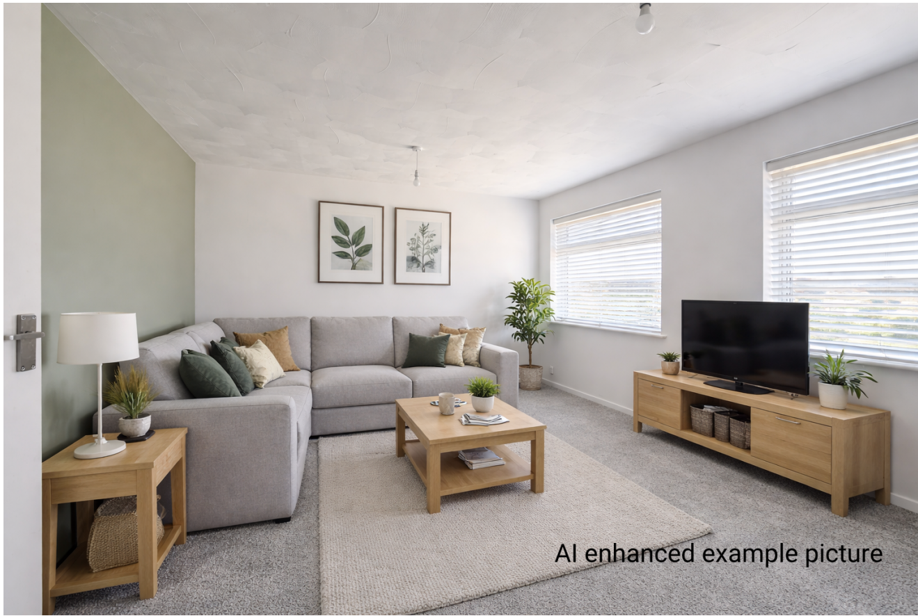
AI enhanced example picture