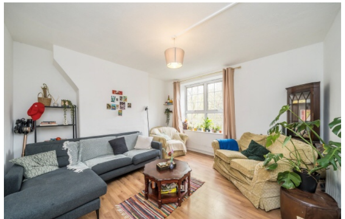
Eastney Street, SE10