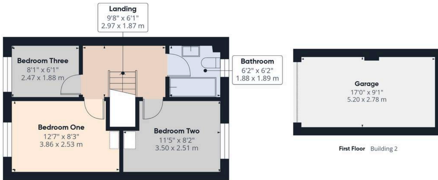
First Floor Building 2