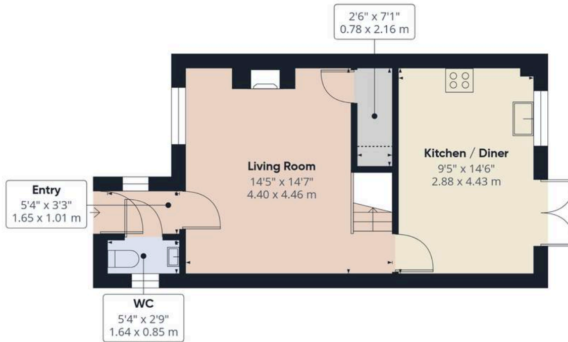
First Floor Building 1