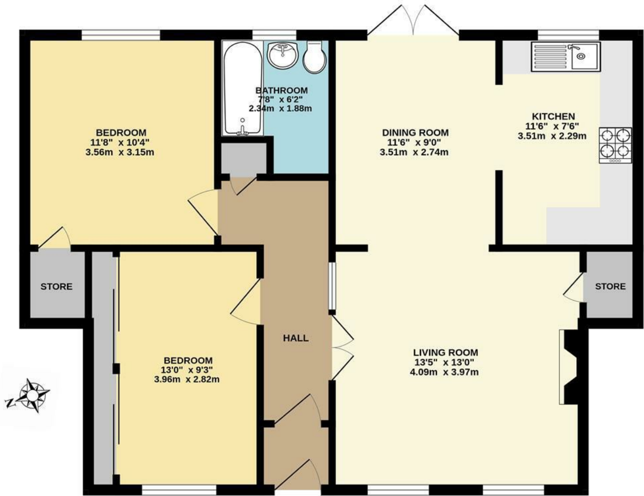
GROUND FLOOR FLAT