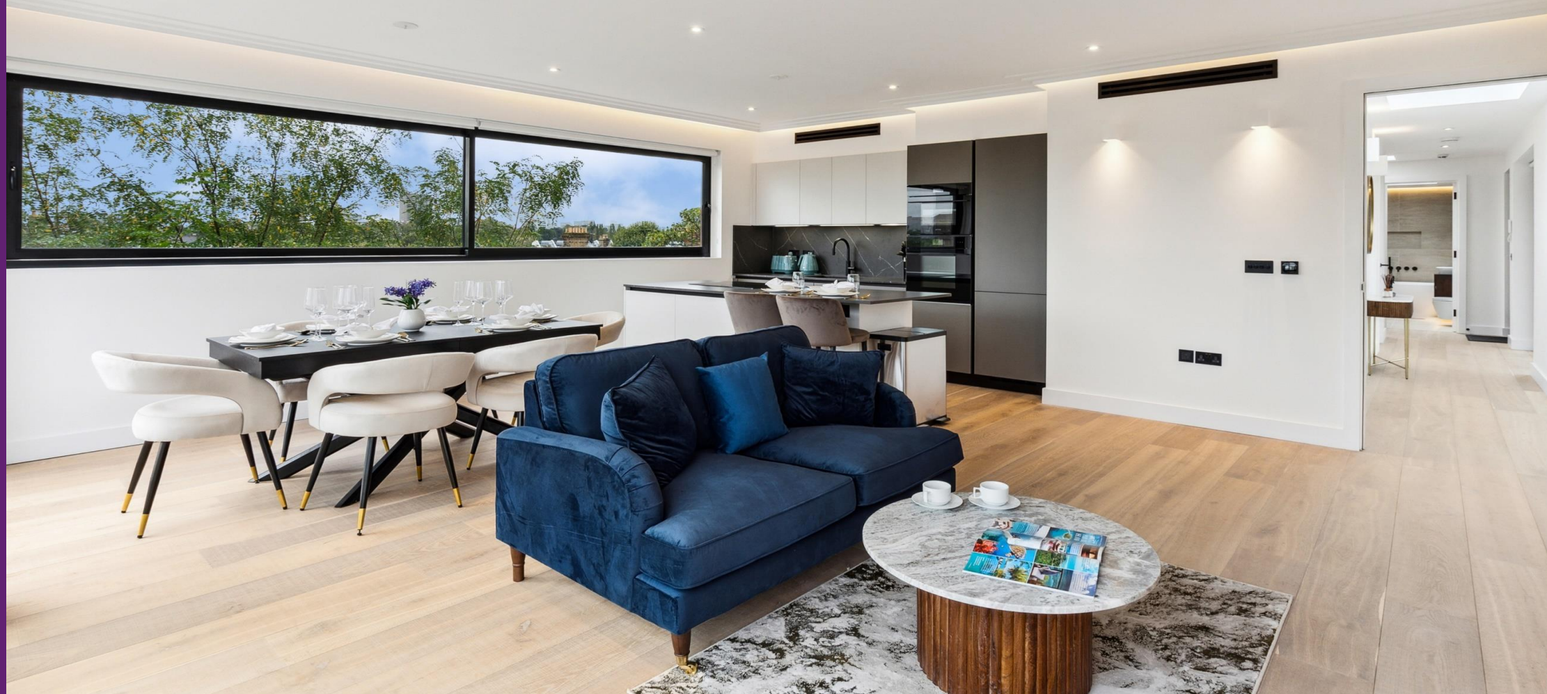
Coronation Court Brewster Gardens, W10