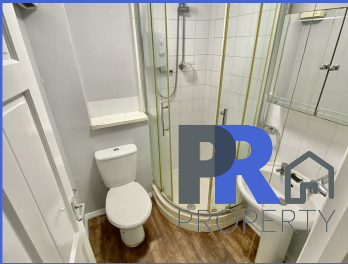
17, Brocket Court Vincent Road, Luton, Bedfordshire, LU4 9BD £90,000