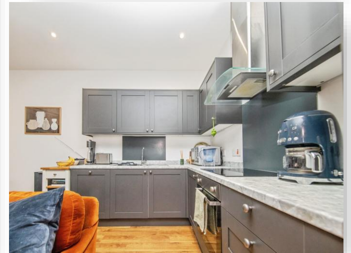
Museum Street, Ipswich, IP1 1HZ