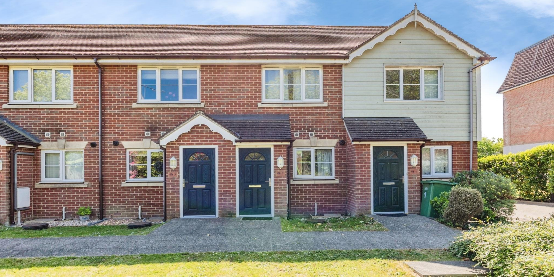
Seacrest View, Hastings TN34 2FA