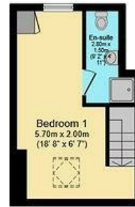
Second Floor Floor area 19.5 sq.m. (210 sq.ft.)

Total floor area: 102.9 sq.m. (1,107 sq.ft.)