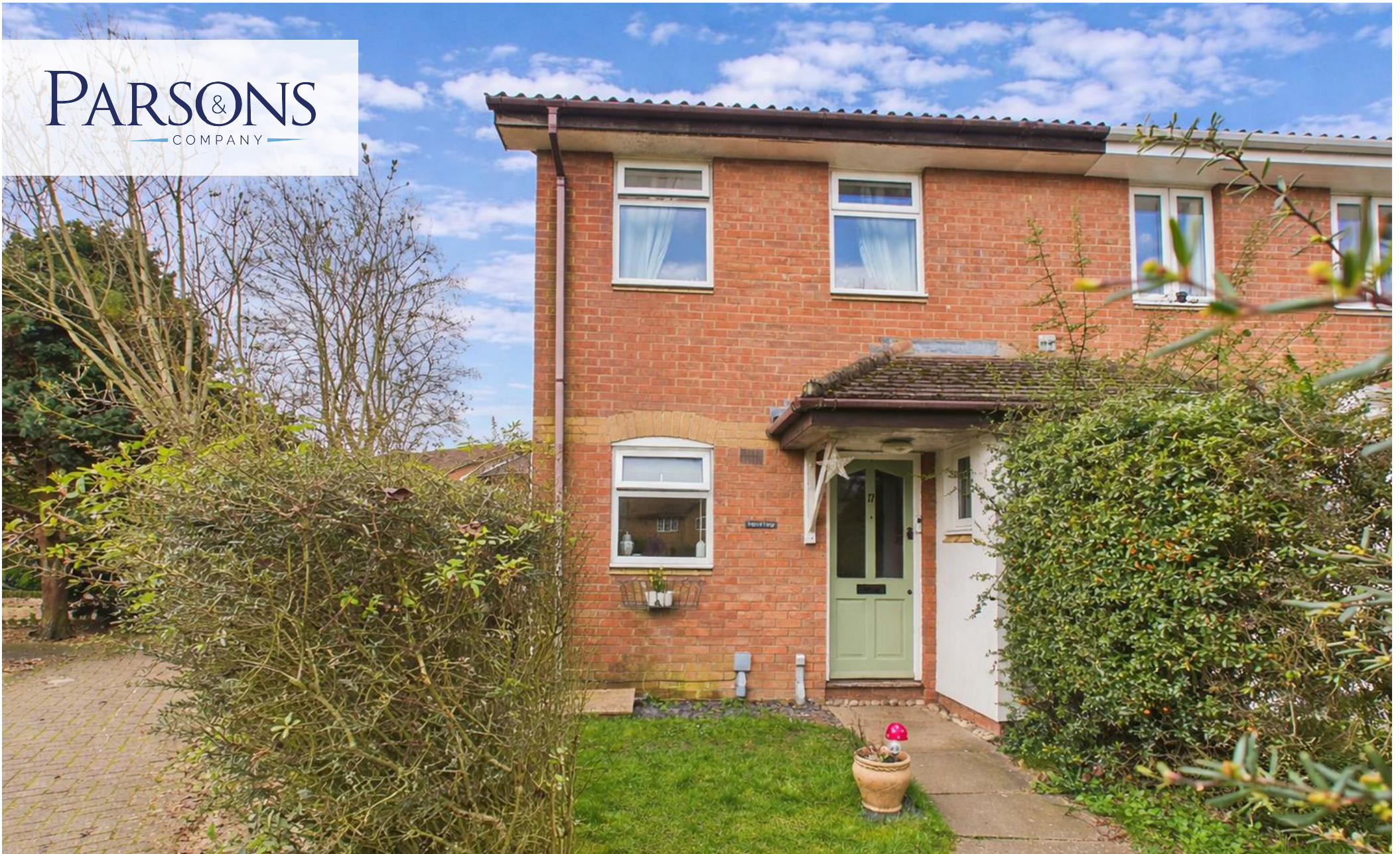
Tournesol Cottage, 17 Amsterdam Way, Dereham, NR19 1XH £200,000